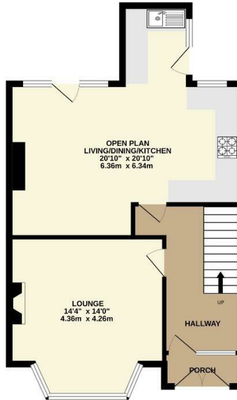
GROUND FLOOR 605 sq.ft. (56.2 sq.m.) approx.